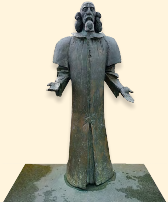
John Amos Comenius